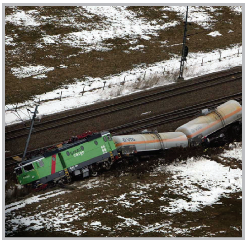
The Swedish crash site. There was no leakage from the CPR wagons.

With this concept, VTG is making another important contribution to optimising the safety of hazardous goods transport services by rail, minimising risks to human health and the environment.